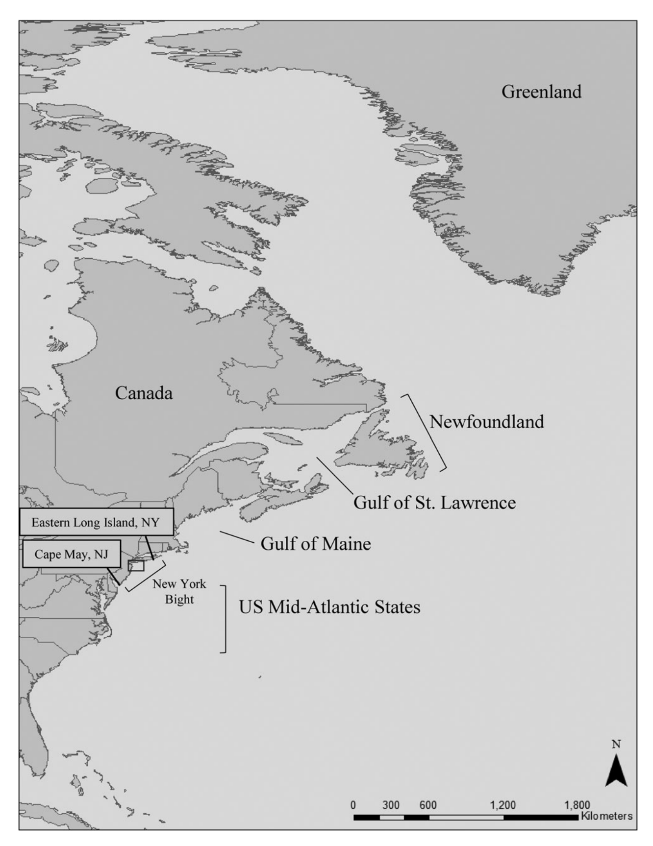
Fig. 2. Map of the western North Atlantic, including specific areas mentioned in this study. The box denotes the New York Bight apex (NYBA) where humpback whale sightings were collected by Gotham Whale from 2011–2018.

collections from off eastern Long Island, New York (separately curated by the Wildlife Conservation Society, Coastal Research and Education Society of Long Island (CRESLI), and the Thorne Lab at Stony Brook University) and the southern portion of New Jersey (curated jointly by Whale and Dolphin