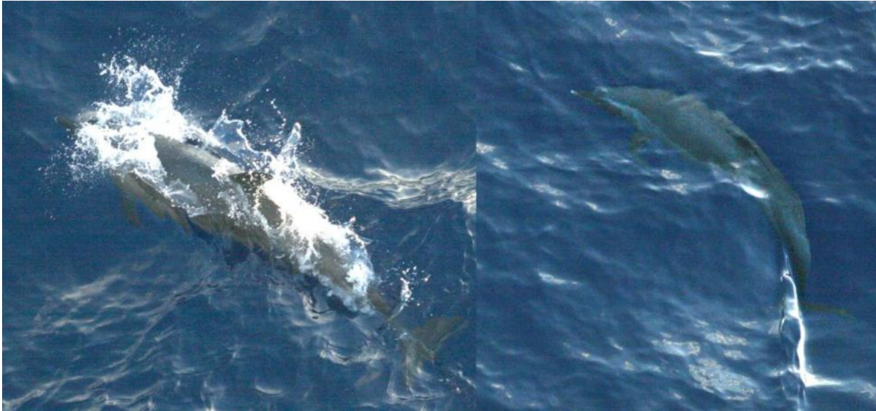
Figure 2. Photographs of spinner dolphin sighting

The spotted dolphins were observed at a distance of 2,055 ft (626 m) by the LMMO. The first cue was splashes and a bird flock. The dorsal fins were observed using binoculars about one minute after the bird flock and splashes were first observed. The subsequent observation of dorsal fins was the confirmation of marine mammals. The dolphins were observed swimming in a fairly tight group, weaving with frequent changes in direction. Given the presence of birds circling overhead and diving into the water and the back and forth swimming of the animals, the dolphins appeared to be feeding. At approximately the same time as the LMMO confirmation of dolphins with the birds, the LMMO heard the Chaplain point out the dolphins to the SMMO. The Chaplain was not on lookout duty and did not report the sighting to the bridge or lookouts. The lookout team did not see the animals during the entire sighting. The dolphins stayed in a fairly tight group, swimming back and forth and were associated with the birds for the entire sighting. They did not appear to change their behavior (e.g. to bowride) in response to the presence of the Navy vessel. The animals were lost off the starboard side after CG-A continued on course.