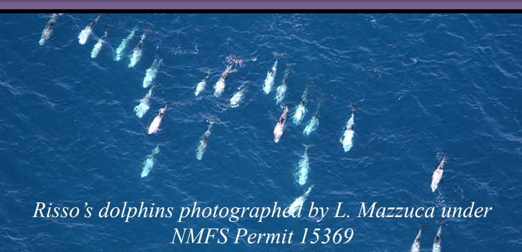
Risso's dolphins photographed by L. Mazzuca under NMFS Permit 15369