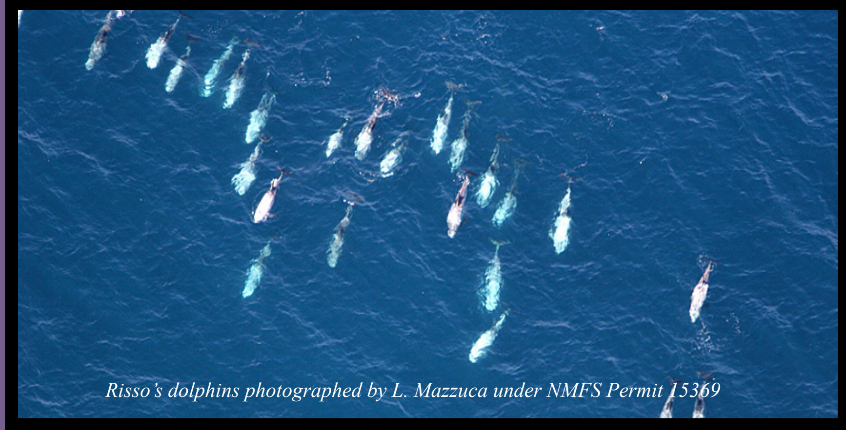
Risso's dolphins photographed by L. Mazzuca under NMFS Permit 15369