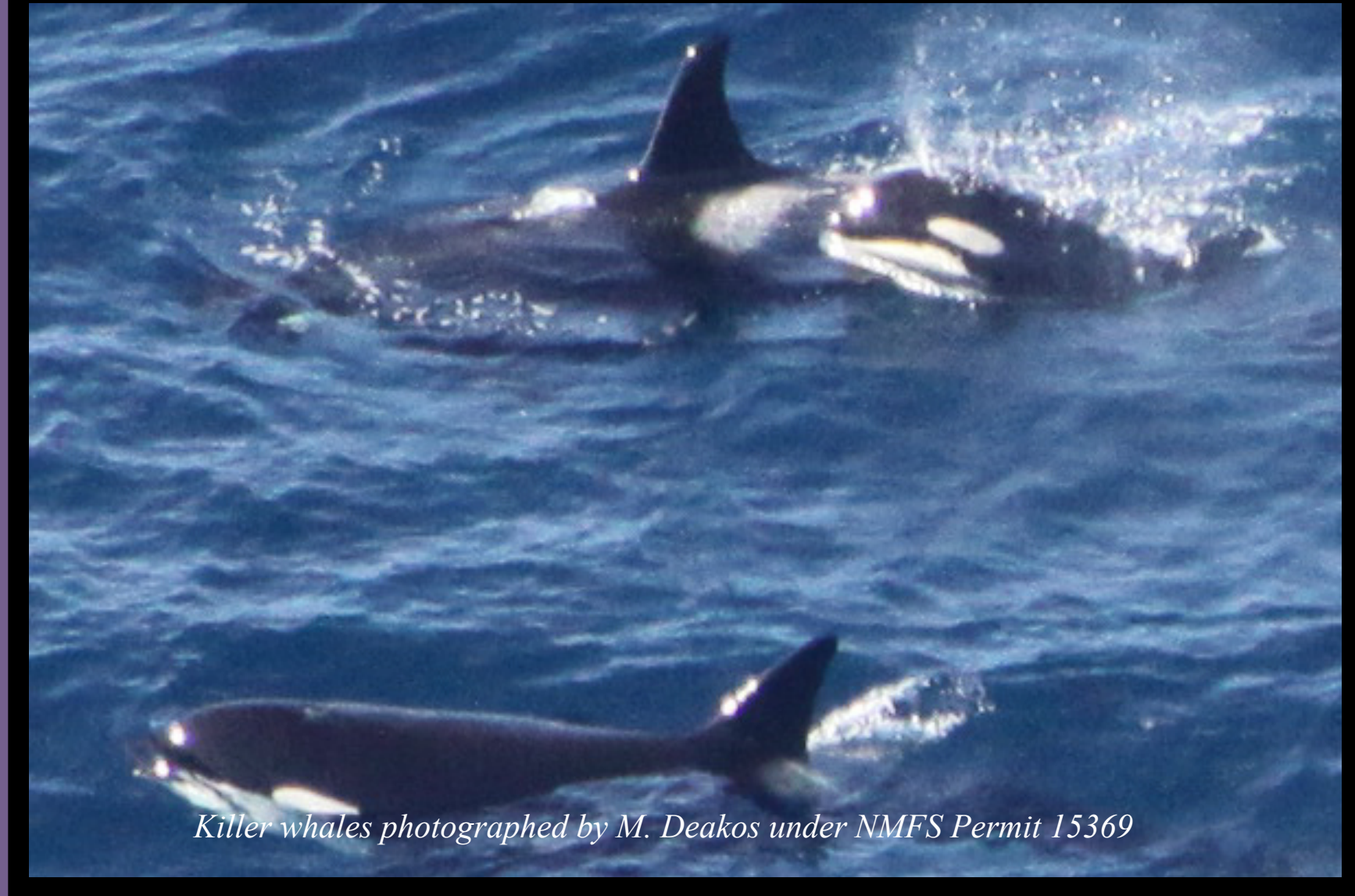
Killer whales