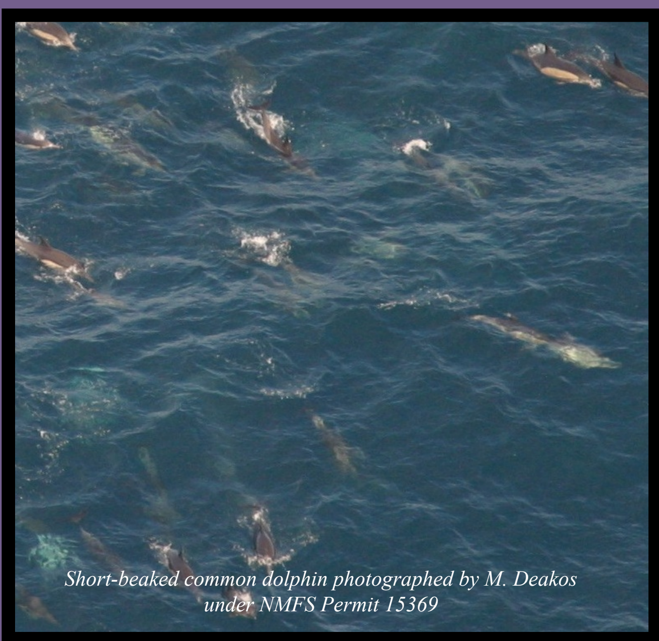
Short-beaked common dolphin photographed by M. Deakos under NMFS Permit 15369